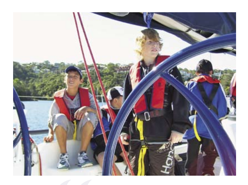
Many of these kids are from a lower socio-economic background

Above and right: Blacktown Tutorial Centre students learn the robes.